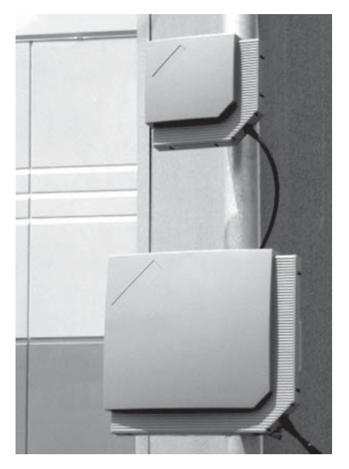
WISP Directional Panels